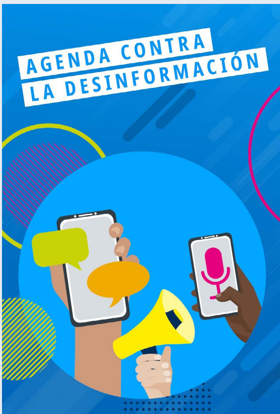
Banner of the "Agenda against Disinformation" facilitated by DW Akademie in Latin America

The rise of left- and right-wing populist actors in Latin America has fuelled polarization and acted as a catalyst for disinformation, especially on social media. DW Akademie facilitated digital encounters between 24 experts from academia, media and civil society from 20 organizations to develop an “Agenda against Disinformation” in Latin America. In four multidisciplinary and cross-sectoral analysis groups they discussed mechanisms, trends and knowledge gaps, focusing on the particularities in the Latin American context. The resulting findings and practical recommendations served to inform organizations, donors and decision makers on the current requirements in the fight against disinformation in the region.