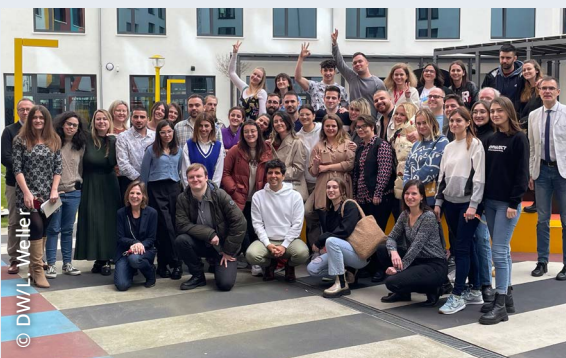
Participants in DW Akademie's CINergy project

In times of aggressive disinformation campaigns in Eastern Europe and the Balkans, innovative and new ways to provide the public with reliable facts are becoming increasingly important. DW Akademie’s CINergy project brought together young, creative people from the media sector, e.g. influencers, fact checkers, journalists or employees of non-governmental organizations, along with academics from the media sector or other experts, to jointly develop media products. The goal was to develop and communicate new, constructive narratives through innovative distribution channels. They were supported by mentors who assisted them in developing their ideas. In the end, three innovative fact-based approaches emerged that connected people/communities across countries or regions and were published to counteract disinformation. An example: the project Democracy in Danger told stories of people affected by totalitarian regimes in the past or present.